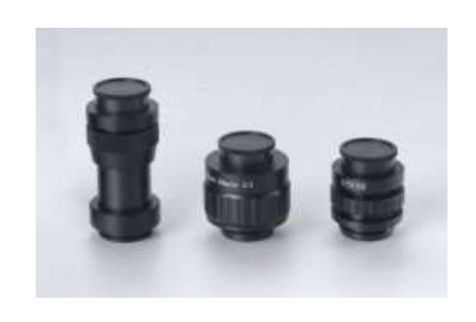
Digital camera adapter C-mount Microscopy image can be output to computer or monitor by connecting trinocular tube and camera device. Then image analysis, processing, storage and transmission would be available

A new generation of professional infinity plan semiapochromatic fluorescence lens with high numerical apertures, which is 25% higher than ordinary plan objective lens, can excite the samples with brighter light and make a substantial increase in image resolution and clarity