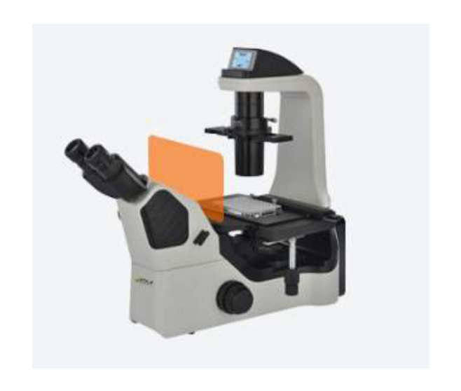
INVE700F Inverted Fluorescence Microscope