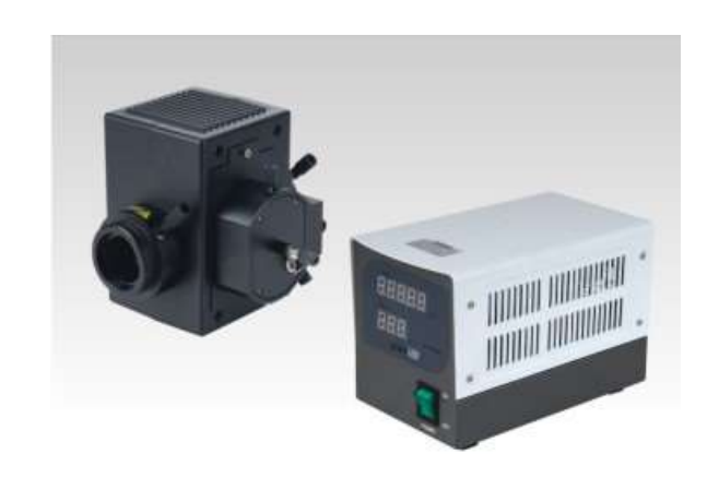
Mercury lamp power supply and power system