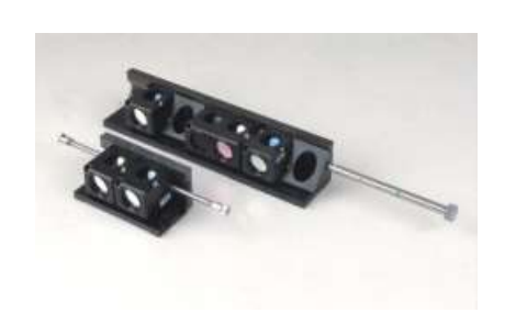
Two-Band or three-band Filter Block Switching mechanism